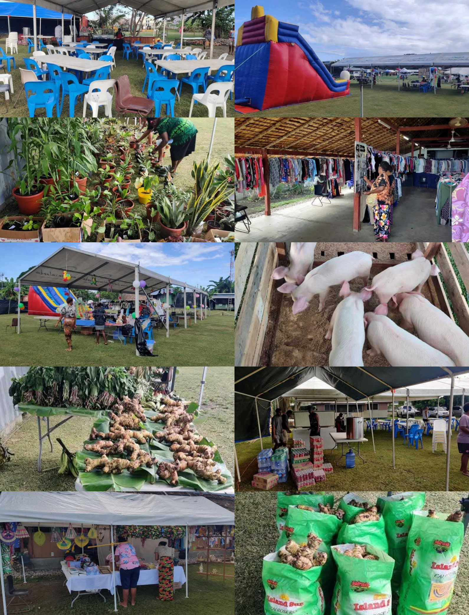
Fundraising efforts undertaken by CRC Gateway Centre for the church building.